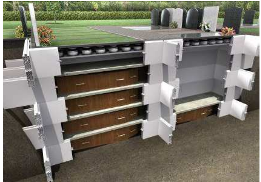
View of the burial plots sub ground level and what users would experience above the surface

Using innovative technology and materials, the burial system can be configured to any depth depending on location and soil conditions.