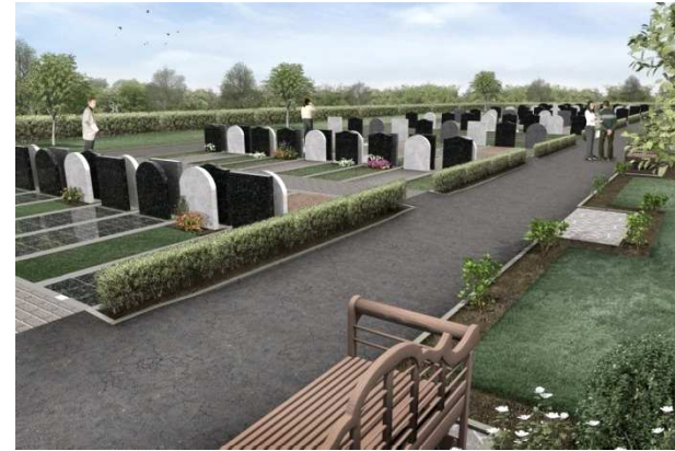
A finished cemetery which is level and accessible