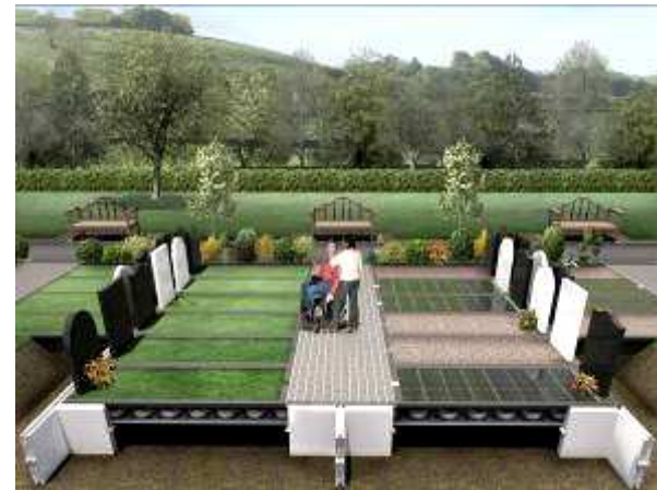
How the space might look as a memorial garden