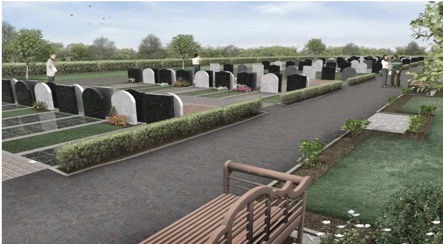
How a new cemetery could look

Greenacre Innovations Ltd has designed a new concept for burials which provides more than twice as many interments in the same space that would be used in a traditional graveyard.